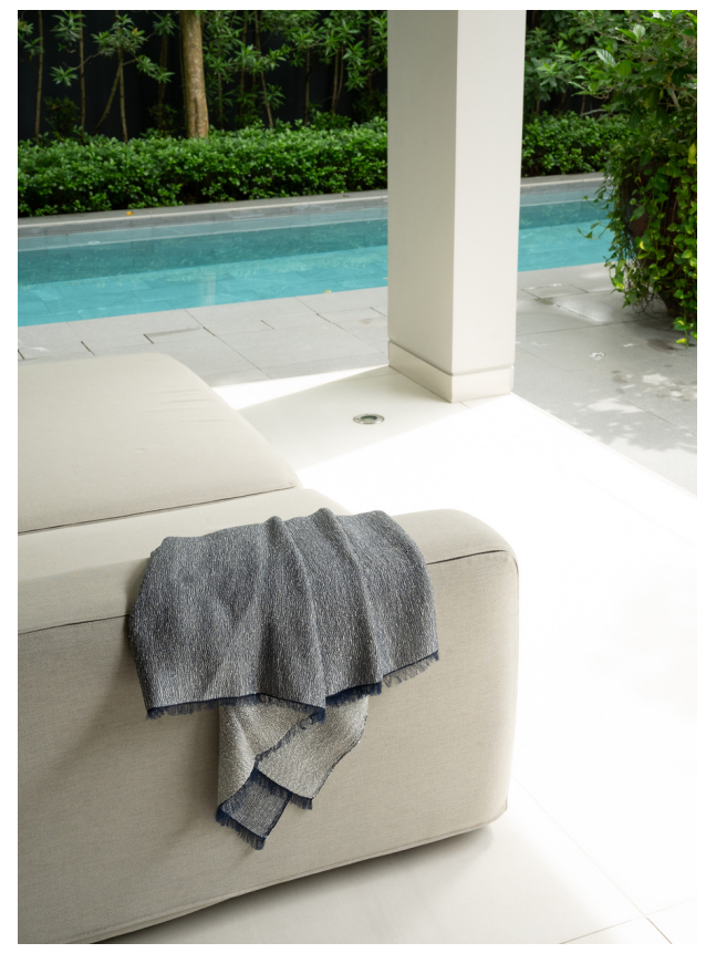
100% Pure Cotton