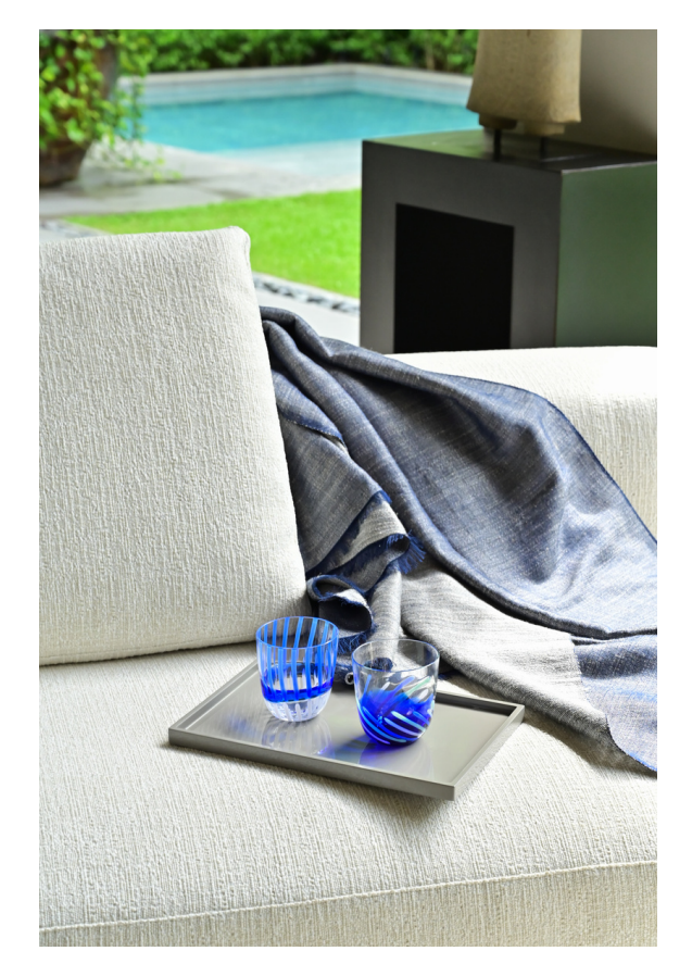
Pure Cotton and Natural Linen Blend